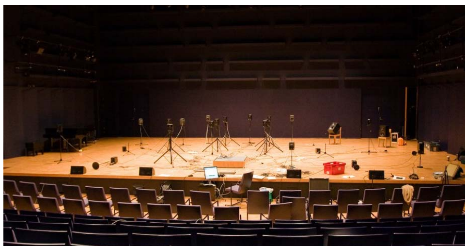
Figure 2 The stage with loudspeaker orchestra seen from recording position R2.